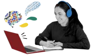
OR REFUGEE VOICES SESSIONS

NaTakallam enhances curriculums, enriches classrooms, and upskills employees across thousands of schools, universities, and NGOs, all while empowering refugees with sustainable income and fostering global awareness.