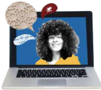
LANGUAGE LEARNING SESSIONS